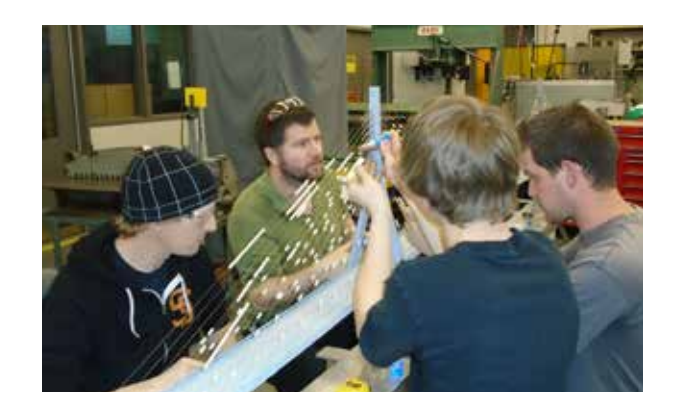
Part of the University Machine Services shop.