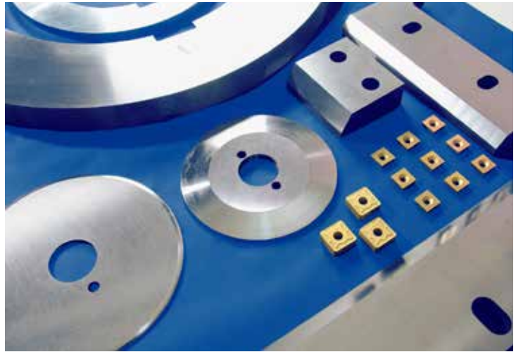
A sample of engineered products from a special product line at ADEK.

"With Global Shop Solutions, we can now measure results properly in every area of the business, and have more confidence in the accuracy of those results. This, in turn, allows us to make better choices about our products and our margins while more clearly identifying the best opportunities for future growth."