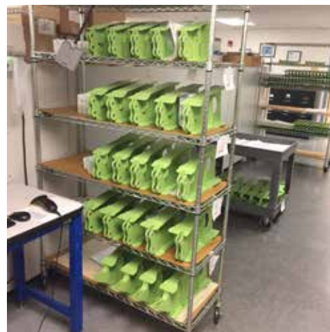
Detail parts ready for assembly.