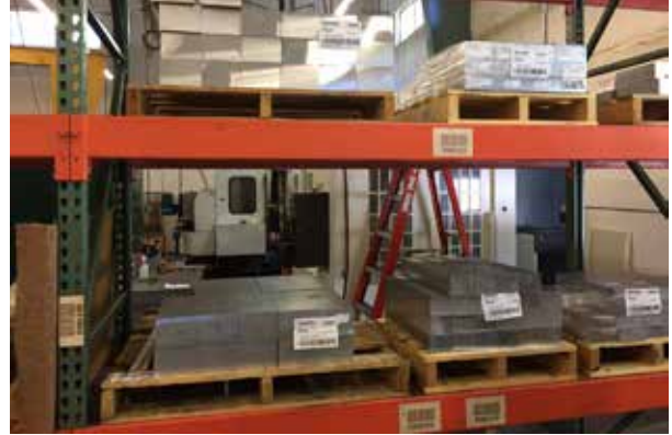
King Machine's station for raw materials.

Founded in 1978, King Machine serves some of the biggest names in the aerospace industry, including Boeing, Magellan Aerospace, GKN, Goodrich, Primus International, and more. In 2013, a small group of senior managers and other seasoned industry professionals purchased the company, and continue to run it as a privately-held business. Collectively, the current ownership team averages 30 years' experience in the aerospace industry.