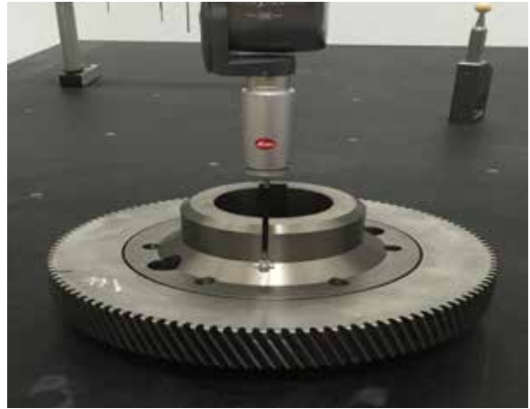
One of QTA Machining’s Coordinate Measuring Machines (CMM).