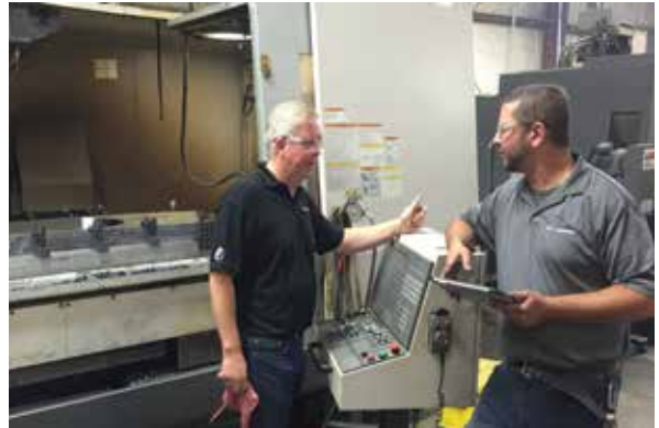
The production manager can dispatch a job from his touchpad device equipped with the Shop Floor Data Collection application.

Operating out of 27,000 square feet of production space, the company's highly skilled machinists also offer precision gear and spline cutting services and specialize in taking on difficult precision jobs that other companies can't or don't want to handle. Committed to quality, QTA Machining is ISO 9001:2015 compliant.