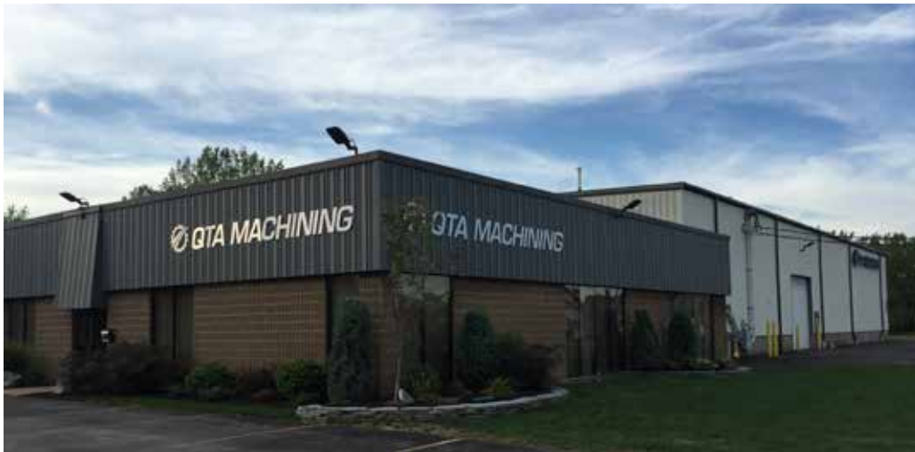
QTA Machining headquarters in Buffalo, New York.