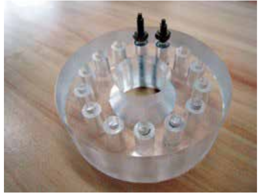
A polyurethane product manufactured by Setsu.